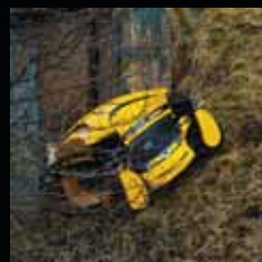
Military areas and airports