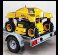
Snow plow SPL01