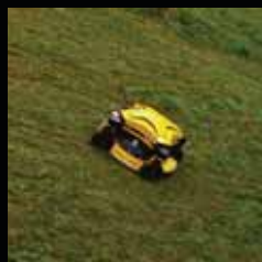
Landfills and mines