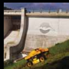
Dams and water reservoirs