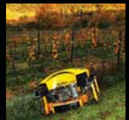
Orchards and vineyards